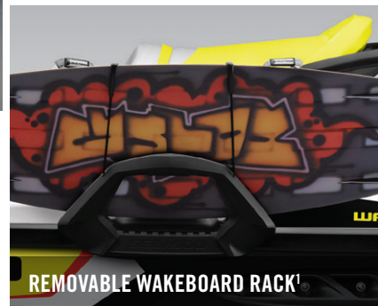
REMOVABLE WAKEBOARD RACK 1