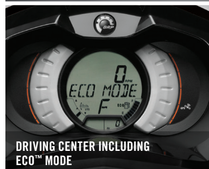
DRIVING CENTER INCLUDING ECO™ MODE