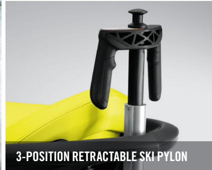
3-POSITION RETRACTABLE SKI PYLON