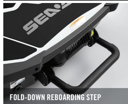
FOLD-DOWN REBOARDING STEP