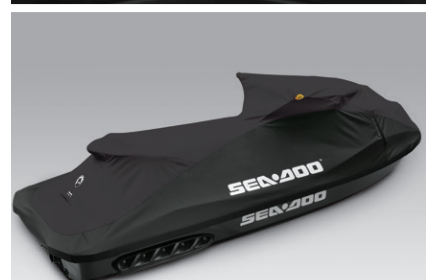
STORAGE COVER (OPTION)