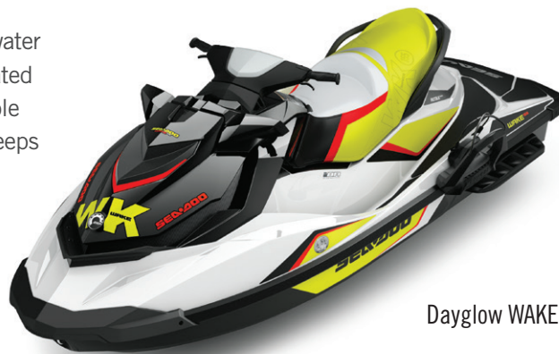
Dayglow WAKE ☀️

Made for those who can't imagine water without the sports. This truly dedicated tow sport watercraft with a retractable ski pylon with high tow point that keeps the rope out of the water delivers versatility to make wakeskating, wakeboard and tubing as fun as possible. It's the official partner of the Nike 6.0 + Wakeskate Team.