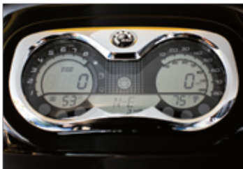
Digital information center