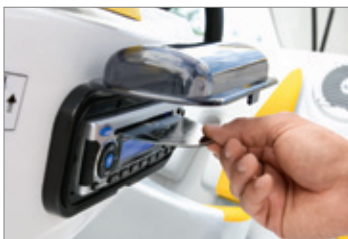
Satellite-ready stereo with MP3 port