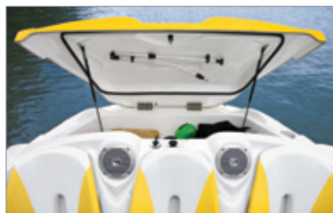
Lockable stern storage